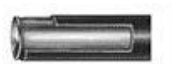
Stainless Steel Liner

12 mm MIP x 19 mm CJ or 19 mm MIP x 19 mm CJ (1/2" MIP x 3/4" CJ or 3/4" MIP x 3/4" CJ)