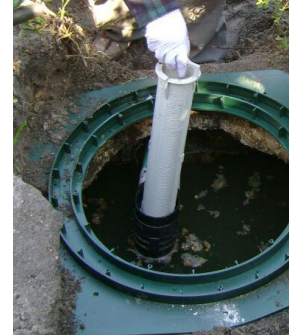
Have your effluent filter checked and cleaned regularly.