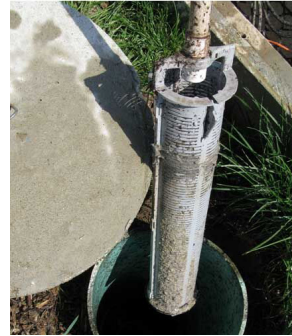
Clogged effluent filters can lead to sewage back ups.

Properly functioning onsite sewage systems can increase the value of your home, prevent costly repairs, stop raw effluent and excessive nutrients from leaching into our waterways and help prevent contamination of aquifers - your source of drinking water!