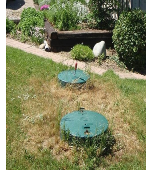
Landscape so that the risers are easily found and accessible.