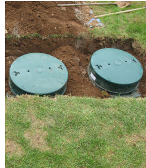
Tank risers ensure safety and accessibility for servicing.