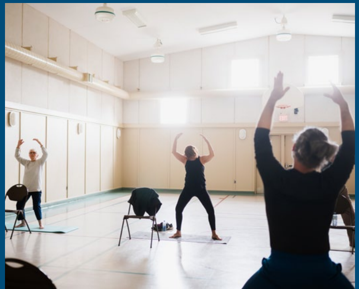
Township of Tiny Aging Backwards Fitness class.

Local Seniors Active Living Centres (SALCs) Bayshore Seniors Club and Georgian Shores Seniors Club, along with Le Club de l'Âge d'Or de Lafontaine further enrich opportunities with activities including arts and crafts, book clubs, woodworking, card games, fitness sessions, educational seminars, and seasonal social events. Whether it's staying active, learning new skills, or enjoying community gatherings, there are many inclusive and engaging programs that help older adults thrive in Tiny.