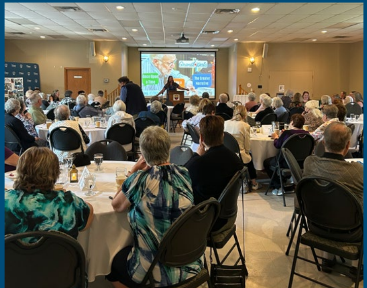
2025 Senior Symposium

The Township of Tiny hosts an annual Senior Symposium at the Township of Tiny Community Centre, a cornerstone event for older adults and caregivers in our community. Launched in 2017 following recommendations from Tiny's Senior Advisory Committee and Local Aging Plan, the Symposium has grown into a highly anticipated gathering. Held as part of June is Seniors Month, this event connects seniors and caregivers with senior-serving organizations across North Simcoe, offering valuable resources, educational sessions, and opportunities to get involved. Beyond information-sharing, the Symposium fosters social connections, encourages active participation in community life, and supports aging well in Tiny.